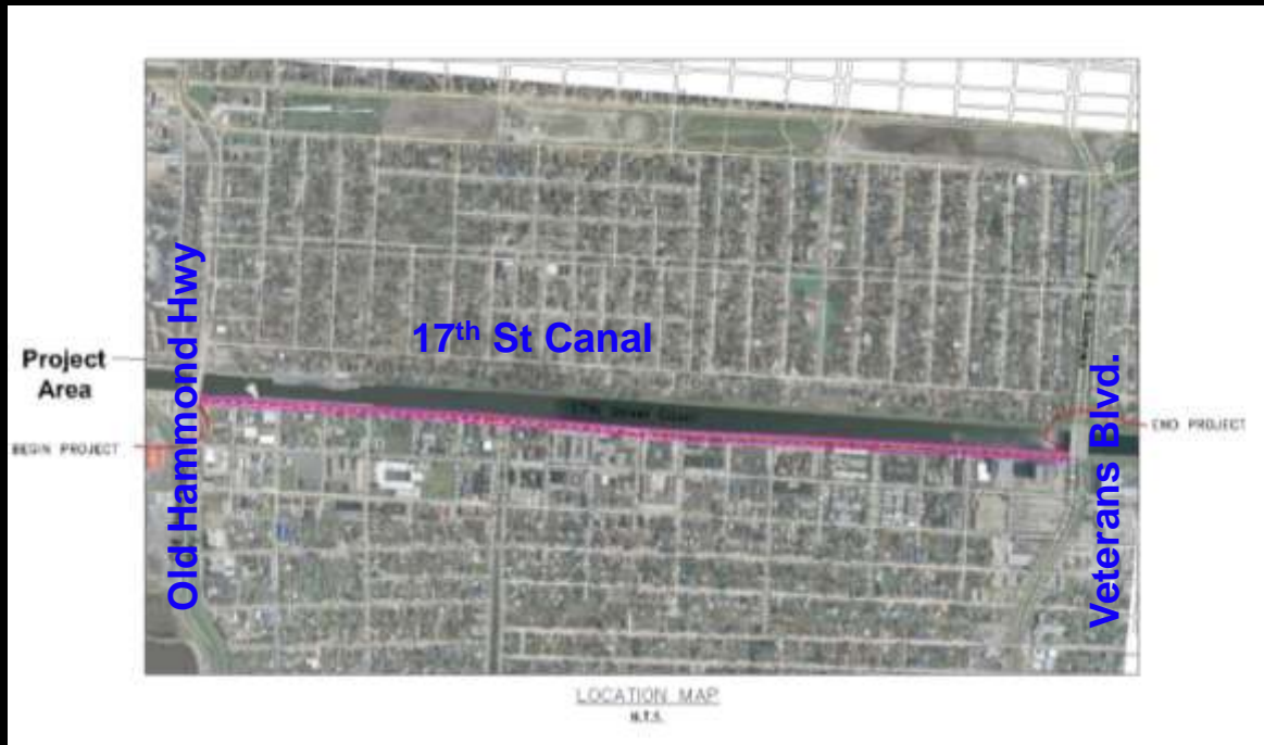
Current Bike Path Extension Project Along 17 th Canal

Envision Jefferson 2020 acknowledges the necessity of creating a multi-modal transportation system that encourages alternative modes of transportation such as transit, walking and biking.