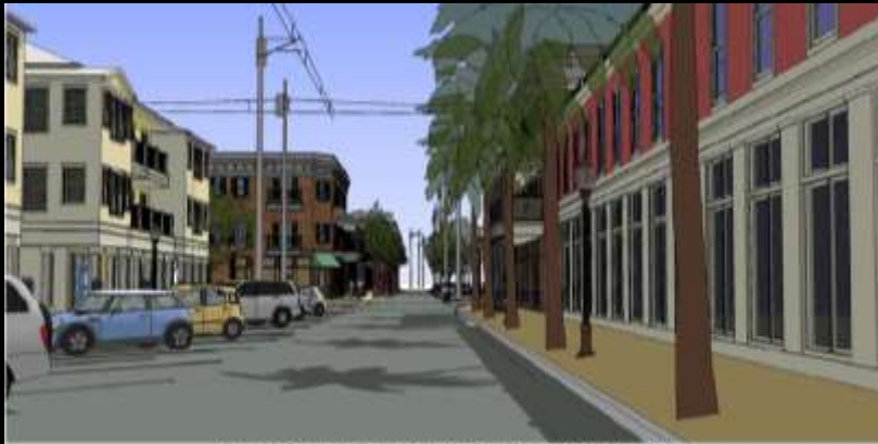
18TH STREET LOOKING EAST ON NORTH SIDE