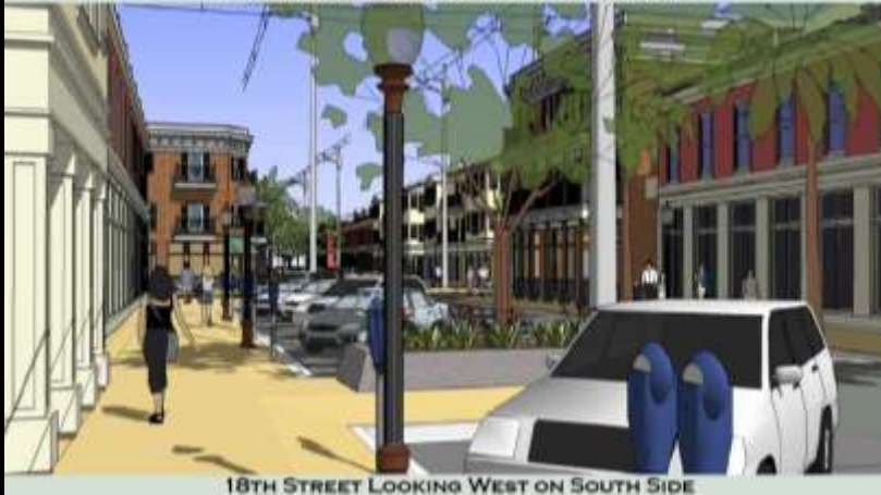
18TH STREET LOOKING WEST ON SOUTH SIDE